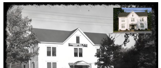
Community & Schools