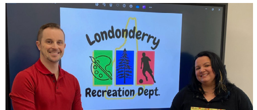
Recreation's New Look