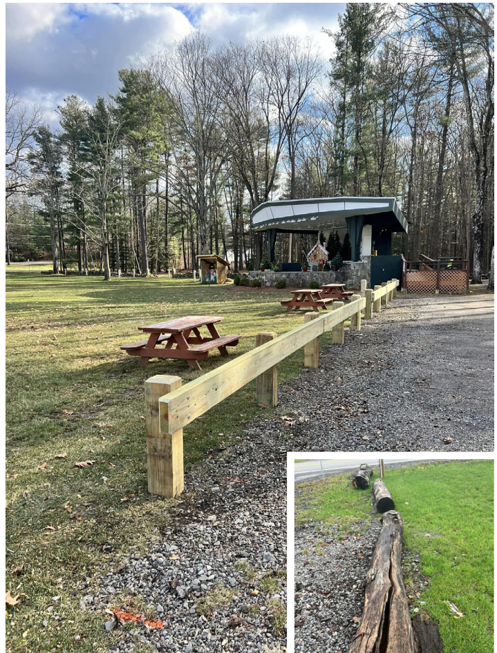
Above: The new fence, courtesy of Eric Turcotte of Turcotte Tree Service Right: The old log barriers