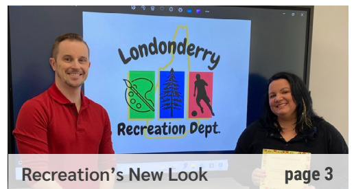
Recreation's New Look