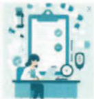
Medication Safety Deep Dive