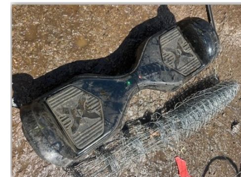
May 2024, Hoover Board with a Lithium Ion Battery, Town fined $525.00

If batteries pass through the metal shredder, they may cause a fire or injury. Also, it results in a fine for the Town of Londonderry.