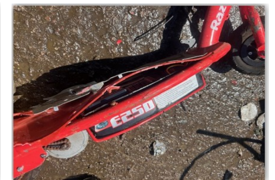
May 2024, Scooter with a Lead acid battery, Town fined $525.00