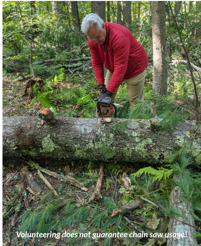
Volunteering does not guarantee chain saw usage!

For those with more energy, more time, and more power tools, the Commission is also seeking volunteers whom they can recruit for trail maintenance days. The Commission arranges maintenance of pre-existing trails as the need arises, and they need a roster of people who are willing to come out and help. Additionally, the Commission recently partnered with the New England Mountain Bike Association, who created two new mountain bike trails in the Musquash that require signs and blazing. All that is needed is a willingness to work hard in conditions that can be rugged. Familiarity with hand tools and power tools is also helpful.