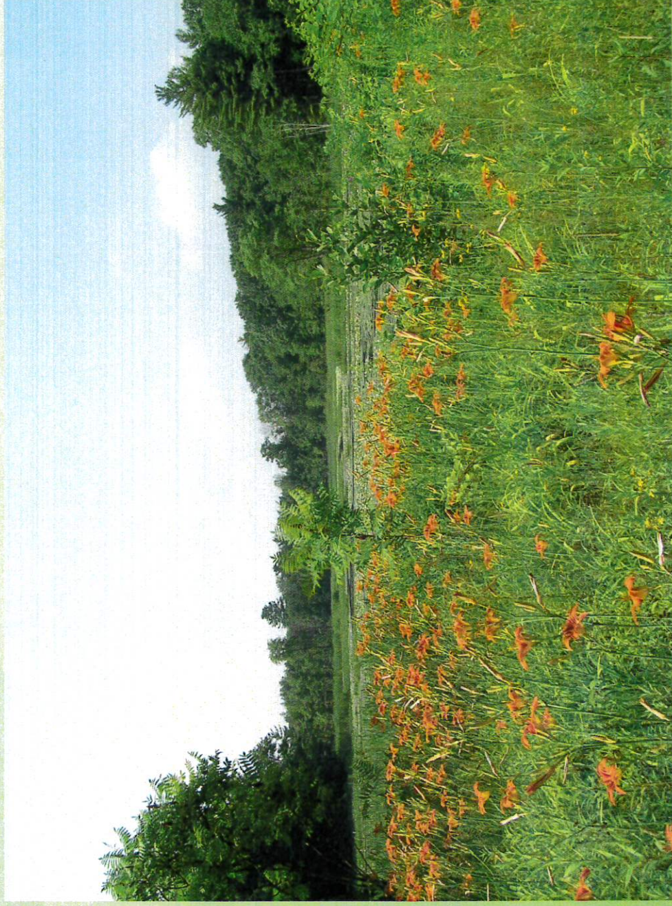
Late summer view of Cohas Marsh from Rail Trail